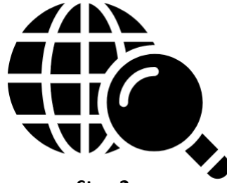
Step 2 Explore an Issue or Problem