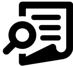
Step 5 Conduct Subject-Specific Research