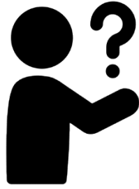
Step 1 Encounter the Task