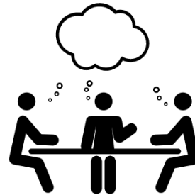
Step 8 Reflect & Extend

Visit the Student Researchers wiki at http://studentresearchers.pbworks.com for Independent Research Seminar information and Symposium highlights.