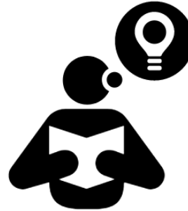
Step 4 Develop a Research Proposal