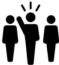
Step 7 Communicate/Present/Share