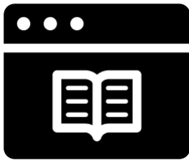
Step 3 Conduct a Literature Review